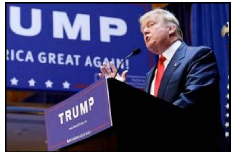
EXAMPLE OF ANNOUNCEMENT VIA RALLY DONALD TRUMP