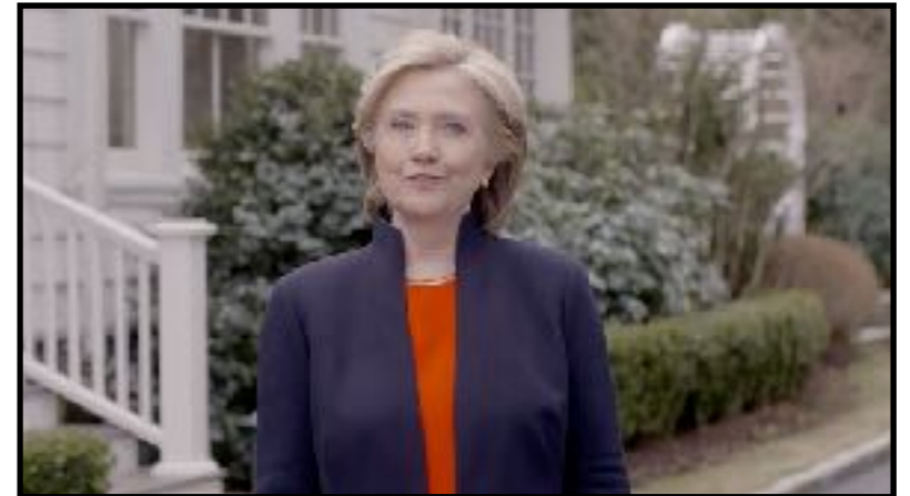
EXAMPLE OF ANNOUNCEMENT VIA ONLINE VIDEO HILLARY CLINTON